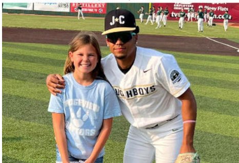
Doughboy Game Night