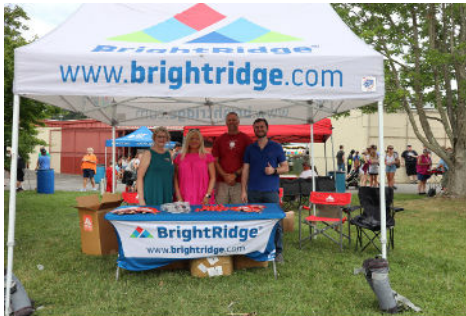
Gray Block Party

We had a great time this summer connecting with our customers we are privileged to serve. Be sure to celebrate the start of the holiday season at Johnson City's Candyland Christmas, November 11 – January 7. The Grand Lighting Ceremony is planned for Saturday, November 25 at 6:30pm so look for BrightRidge's tree as you stroll through Candyland.