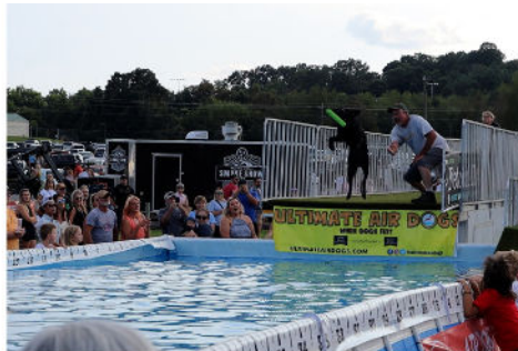
Meet The Mountains Festival