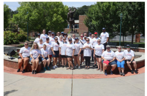
BrightRidge Broadband Block Party