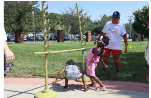
BrightRidge Broadband Block Party